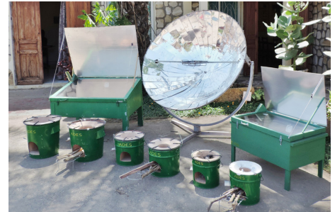
Different types of locally produced stove models are available.