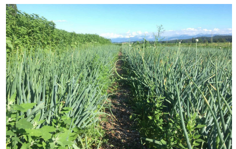
Mixed cropping and mulch promote humus accumulation at SlowGrow in Mönchaltorf.