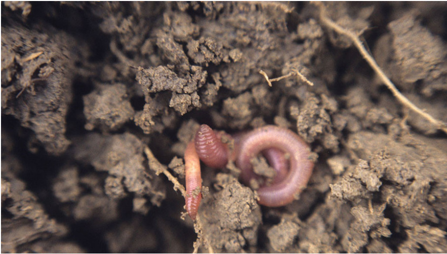
Earthworms contribute significantly to humus-rich soil and to the mixing of soil layers.

This pioneering climate protection programme stores carbon in agricultural soil. Soil erosion and humus loss are a major problem worldwide, but also in Switzerland and neighbouring countries. The programme enables organic farmers to implement measures, which positively affect soil fertility. It thus contributes to a climate-friendly agriculture and to food security.