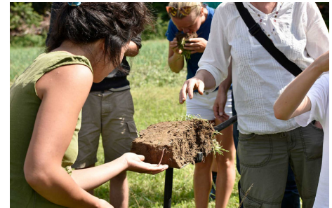
At farm visitor days everyone can experience soil fertility on-site.