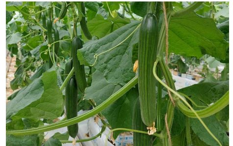
Cucumbers in one of the greenhouses at Grob Gemüse Ltd.