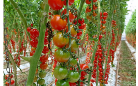
Cherry tomatoes in one of the greenhouses at Grob Gemüse.