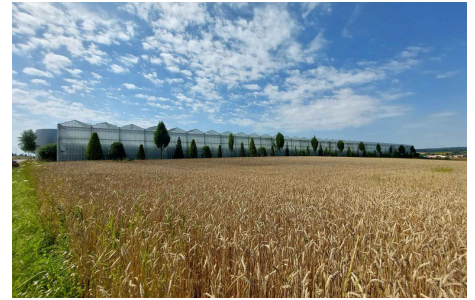
External view of one of the greenhouses at Grob Gemüse Ltd.

Around 2,015 t CO 2 will be saved annually.