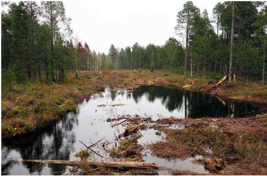
Result of the first renaturation stage: dammed drainage ditch at Etang de La Gruère.

Thanks to this climate protection project, various areas of the unique raised bog in La Gruère from the canton Jura can be restored to its natural state, resulting in the release of less greenhouse gas into the atmosphere. But climate protection is not the only advantage of rewetting this moorland; it also benefits biodiversity, the water balance and the local construction industry.