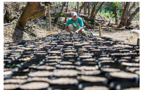
One of the projects nurseries for growing thousands of seedlings.