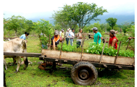
Loading the cart with seedlings: Each rainy season, entire villages come together to plant hundreds of thousands of trees.