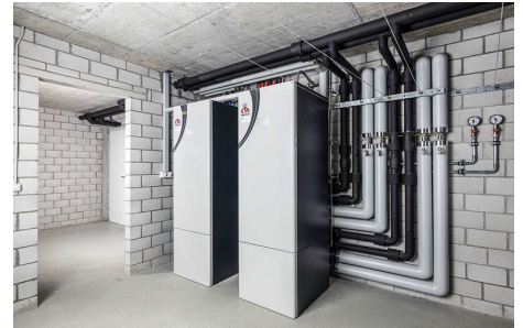
By arranging them in a cascade, heat pump systems can also achieve very high heat outputs for apartment buildings.