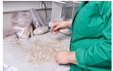
Laboratory check.