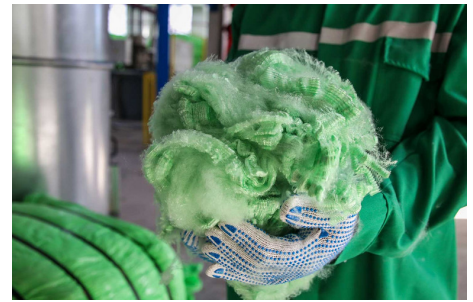
Among other things, polyester fibres made from recycled PET bottles are used in textile production.

In so-called “circular economy partnerships”, together with the city of Buzău and other communities in Romania, the project partner encourages the implementation of better waste separation and recycling infrastructures. The project “Circular Buzău” was created by Greentech with local partners. They aim to work towards a circular economy for Buzău by engaging with the local communities through various activities: creating a park as an urban regeneration project in Buzău that also