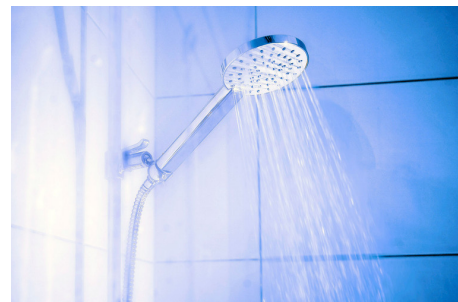
The perceived comfort remains the same. The soft shower jet is enriched with air.

Any questions? Feel free to send us an email or give us a call (+41 44 500 43 50).