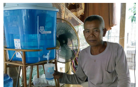
The water purifiers are fitted with a practical tap.