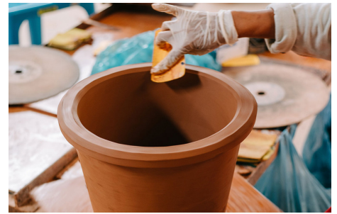
The purifiers are mixed from local clay and rice husks and pressed into a mould.

To date, 70,181 water purifiers have been sold and improved the access to clean drinking water for more than 400,000 people.