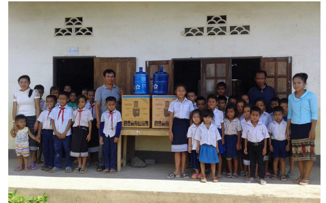
This primary school is located close to the production site.