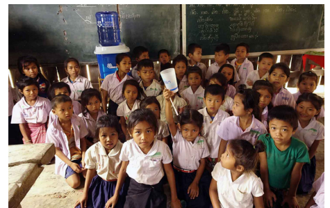
In this classroom situated on one of the 4000 islands on the Mekong River in the south of Laos, purified water is consumed daily.