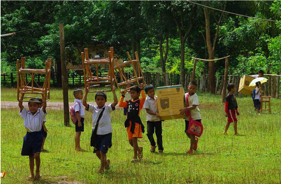
During delivery to a school in the district of Lao Ngam in the province of Salavan, children returning from their lunchbreak help to carry purifiers and stands to their classrooms.

This climate protection project produces ceramic water purifiers locally, thereby providing the rural population in Laos with reliable access to clean drinking water. Reduced deforestation results in lower carbon dioxide levels and local forest ecosystems are protected. The risk of diarrhoea is reduced and the economic situation of households is improved. The project also lowers the volume of air pollution to which women and children are exposed indoors.