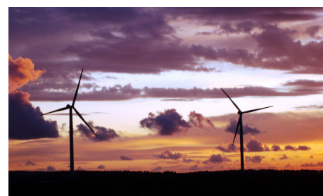
The wind power plants help to reduce Turkey's energy deficit in an environmentally-friendly way