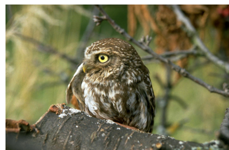
The highly endangered Little Owl benefits from standard fruit trees.