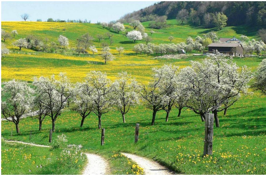
“What would the Table Jura be without its proud standard-form plum and cherry trees?” Pierre Coulin, CEO of Hochstamm Suisse.

The nationwide support programme for standard fruit trees in Switzerland supports farms with the planting and regular upkeep of standard fruit trees. The planted trees absorb CO 2 from the atmosphere and thus act as carbon stores. At the same time, the standard fruit trees make a valuable contribution to the preservation of biodiversity.