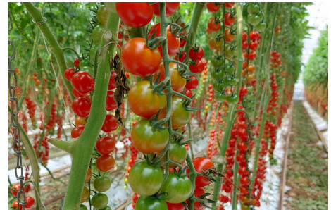
Cherry tomatoes in one of the greenhouses at Grob Gemüse.