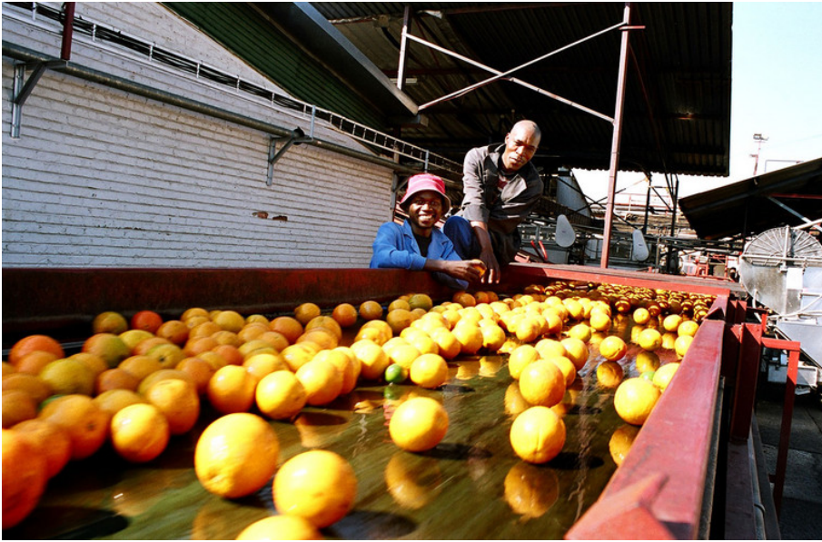
A South African citrus farm and fruit juice producer switches from fossil fuel to climate-friendly biomass for steam and heat production.

A South African citrus farm and fruit juice producer switches from fossil fuel to climate-friendly biomass for heat production. Thereby this project reduces greenhouse gas emissions and makes use of a so far untapped local renewable energy resource.