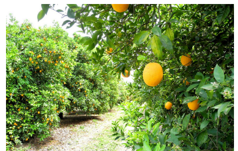
There is still a lot of manual work at the farm. The oranges are being harvested without machines.