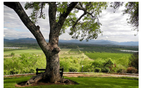
The citrus farm cultivates oranges, grapefruits and bananas on an area of around 1,800 hectares.