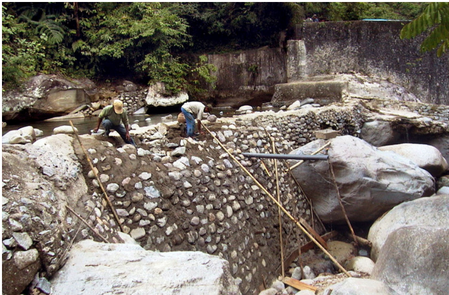
Reconstructing of the historical dam with local raw materials.

In Indonesia, a micro hydroelectric power plant is being renovated and recommissioned, and renewable power fed into the regional power supply system. Through the replacement of diesel-based power, greenhouse gas emissions are lowered.