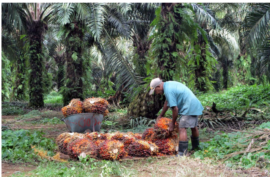
Harvesting of palm fruits: palm oil is a product of the fruits of Elaeis Guineensis Jacq. oil palm. This specific palm grows only in a small corridor around the Equator.

Using a new form of waste water treatment, the climate protection project captures large quantities of methane. This results in fewer greenhouse gases being emitted into the atmosphere. In addition, the biogas produced from the methane can be used for electricity production.