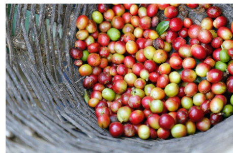
75–80% of the coffee produced worldwide is Arabica.