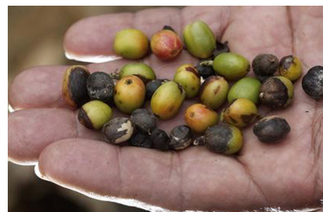
Coffee fruits affected by a fungus known as leaf rust ( Hemileia vastatrix ).