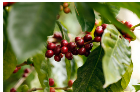
The cultivation of shade grown coffee is an effective carbon sink that plays an important role in Nicaraguan livelihoods.

Women make up 45% of the professional team, many of whom hold leadership positions.