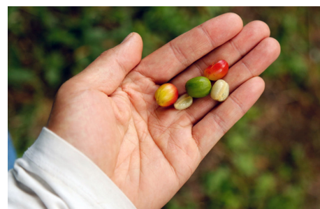
A coffee bean is the seed of the coffee plant. It is the pit inside the red fruit. The fruits contain two stones with their flat sides together.