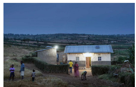
Light increases the sense of security of the rural people and allows children to do their school work even in the evening hours.