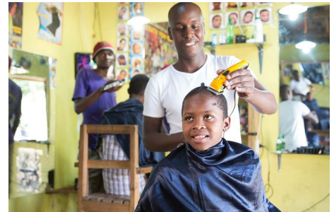
... this solar powered barber shop...