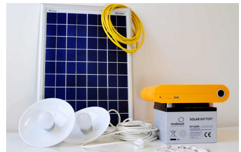
A small solar home system with panel, battery and two lamps.