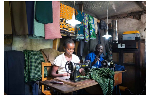
The larger solar home systems can power small businesses enabling entrepreneurial customers to create additional income like this tailor shop...

The project promotes the dissemination of sound technologies to developing countries at favorable terms, with over 107,746 systems in Tanzania.