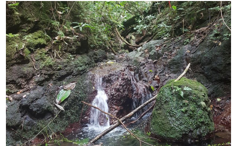
There is no need for treatment - the water of this small creek is pristine and protected by this project.