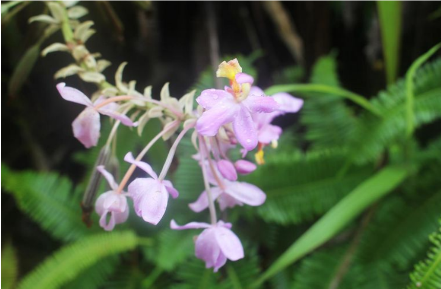
The Drawa rainforest contains 26 orchid species including many that are rare or endemic.

This carbon offset project aims at preventing further deforestation of a globally significant ecosystem. Instead of earning their living by harvesting timber, the local landowners - several Fijian clans - will establish a protected area which generates carbon credits.