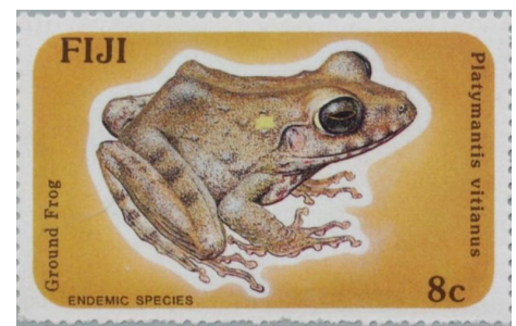
Fijian Ground Frog on stamp - an endangered endemic specie.