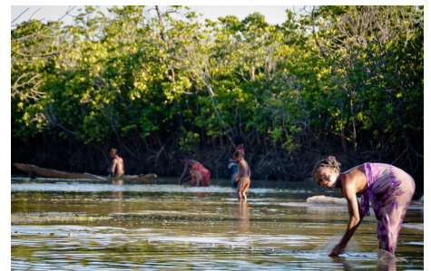
Fisherwomen and fishermen are trained in effective fishery management to avoid seafood overexploitation.