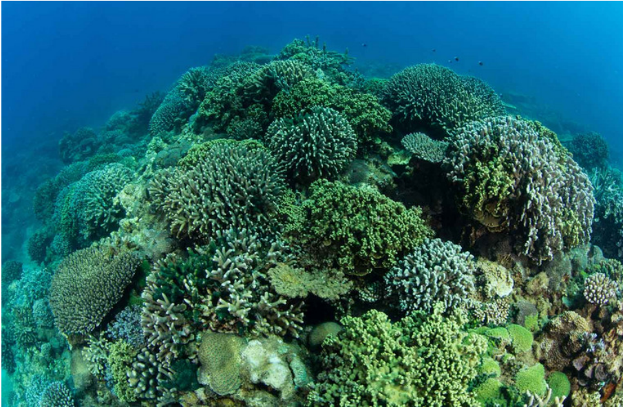
When coral reefs are preserved, habitats for endangered species are protected.

This climate protection project fosters sustainable use of mangroves, or “blue forests”, to avoid deforestation and degradation. Healthy, intact mangrove forests take up carbon, protect the population from natural disasters and help conserve coral reefs - a key habitat for endangered species.