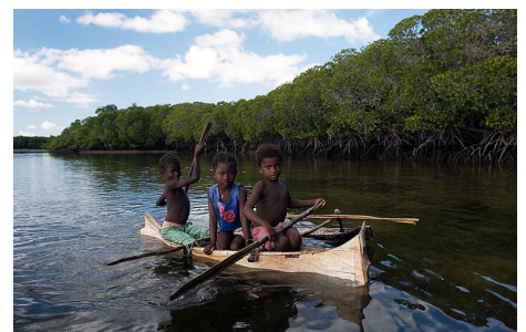
The mangrove forests in the Bay of Assassins are home to approximately 3'000 people.