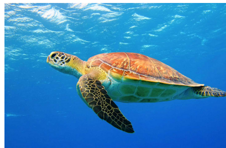
Green turtle: Classified as endangered.

Women are actively engaged in the project as carbon monitors and members of the marine management association.