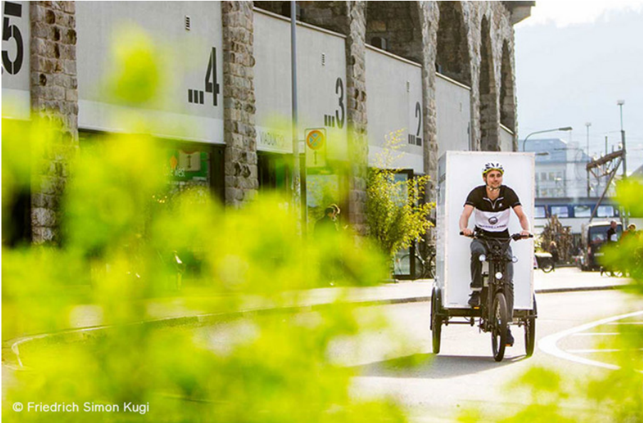
An eCargo trike in city traffic.

The myclimate climate protection programme supports businesses that want to start using electric cargo trikes and bikes to transport goods. The goal is to stop the use of fossil fuel-run vans for transporting goods in city centres and to replace these with electricity-powered cargo bikes.