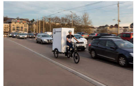
Speed up: Avoid traffic jams by taking the bike lane with an eCargo trike.