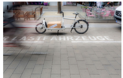
Less space – more freedom of movement: eCargo trikes and bikes boost quality of life in cities.