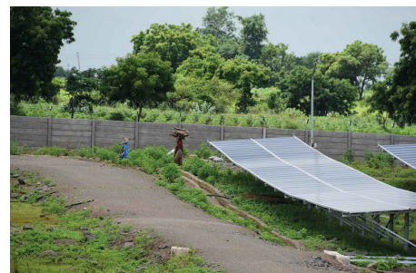
Solar farm in Mukti village.