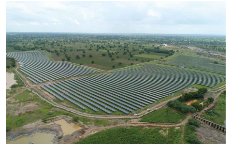
Solar farm in Vickhede village.

The project reduces about 220,000 CO 2 per year.