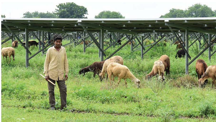
Grazing animals in the midst of power generation. Solar farm in Varul village.

This carbon offset project replaces fossil-produced electricity with clean solar energy. In the Indian state of Maharashtra, ten villages supply clean electricity to the Indian grid with their respective solar power plants.