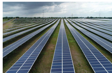
Solar farm in Mukti village.