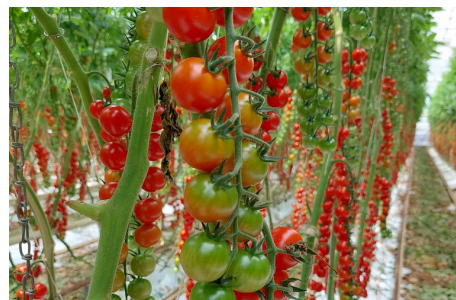
Cherry tomatoes in one of the greenhouses at Grob Gemüse.