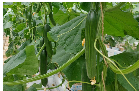
Cucumbers in one of the greenhouses at Grob Gemüse Ltd.