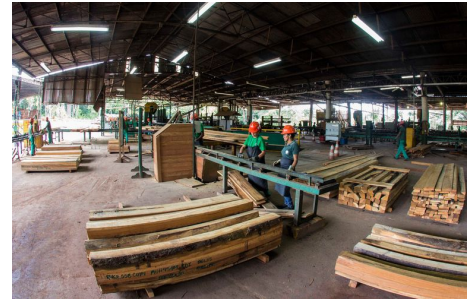
Sawmill of Precious Woods. The employees like that the sustainable forest management allows the forest after harvesting to fully recover in a few years.

1,328,694 tonnes of organic waste processed and avoided from anaerobic decay.