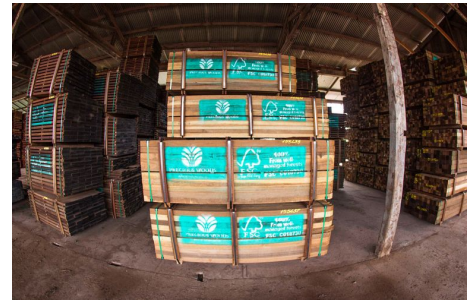
All harvested timber is FSC certified.