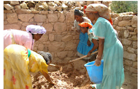
The efficient mogogo ovens are constructed by the village's women themselves.