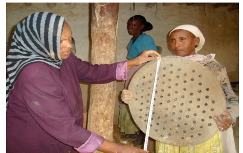
Trained instructors assist the women of the village in the construction of the ovens.