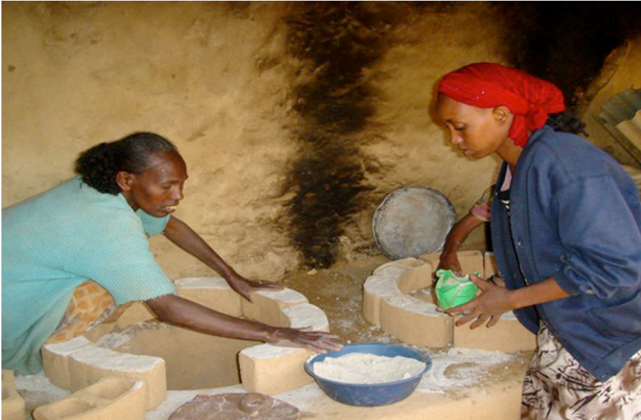
The village's women fill the gaps with sand and clay so that a stable construction is created.

The climate protection project in Eritrea supports the villagers in building smokeless, efficient ovens. The reduction of the smoke and greenhouse gases benefits the climate and at the same time promotes the health of women and children.