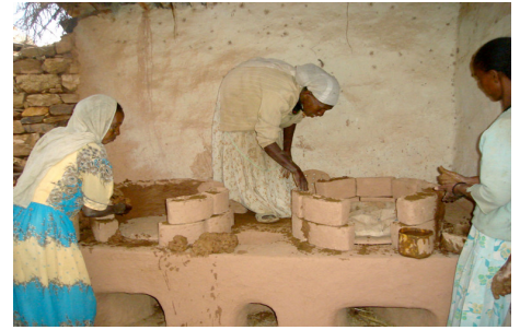
Working together, the women erect the upper part of the mogogo oven with prefabricated tiles.

The project saved 17,300 tons of firewood equaling 540 ha of forest area.